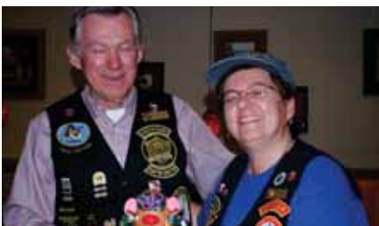
Chapter T receives the Hot Potato from Chapter E