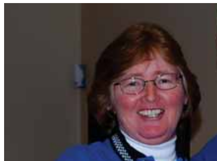
Photographer Becky Lees